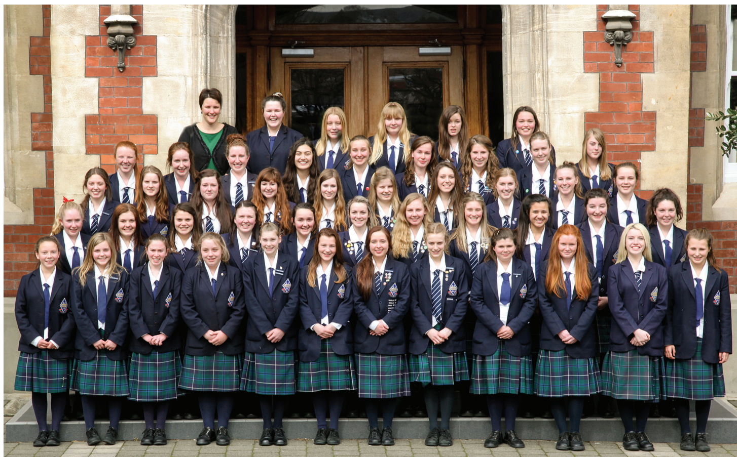
Current OGHS Students and a staff member, who are descended from former students of the school.

Do you recognise yourself in these photographs? The gymnastic display was taken in 1946 or 1947. The other two photographs are of school productions. The centre one taken in 1954 was "You Never Can Tell" and the right hand performance was from the 1960s - performance unknown. Let us know if you recognise any of the students.